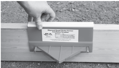
Diamond Dowel® installation template