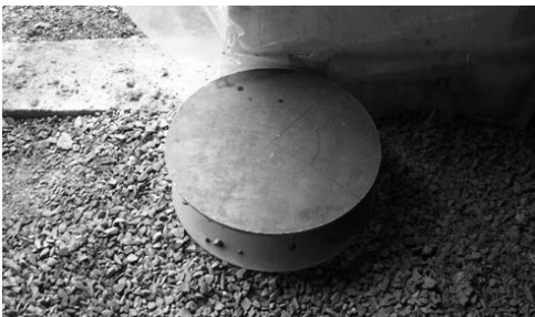
PNA bollard base on level subgrade