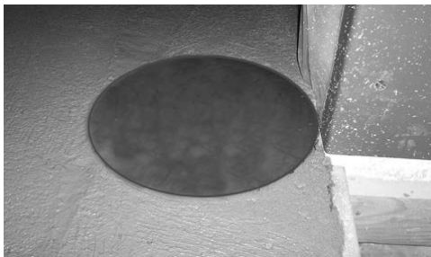
Easy-to-finish to edge of plate